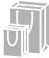
Jewelry paper bag