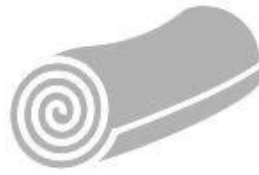
Jewelry Roll bag