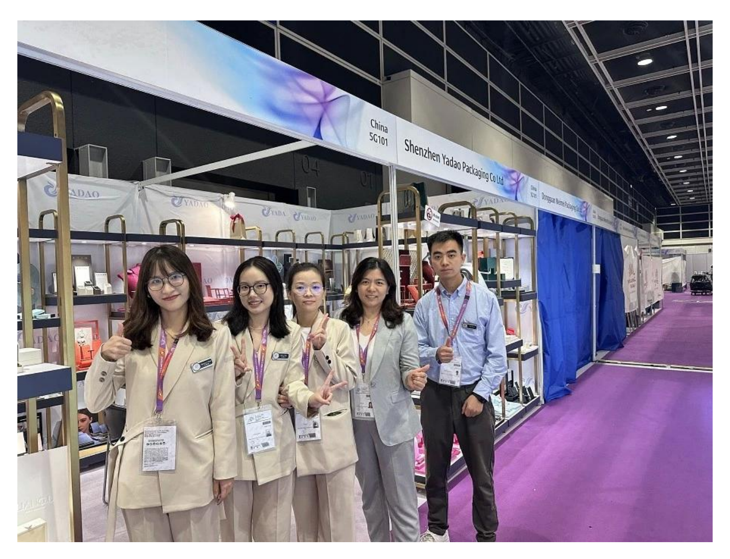
See you in SEPT. []HK Jewellery Exhibition[]