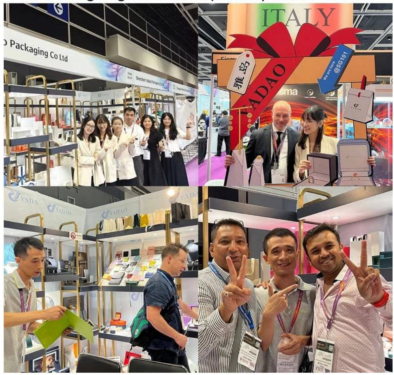
2023 Hongkong international jewellery exhibition show